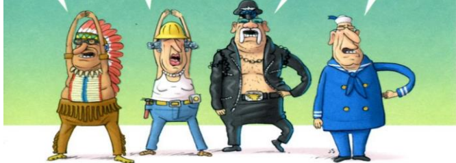
The Retirement Village People